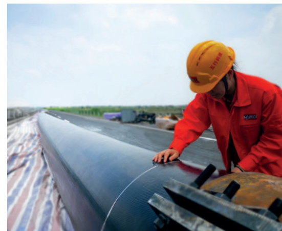
Individual lengths of up to 3 km on one pull