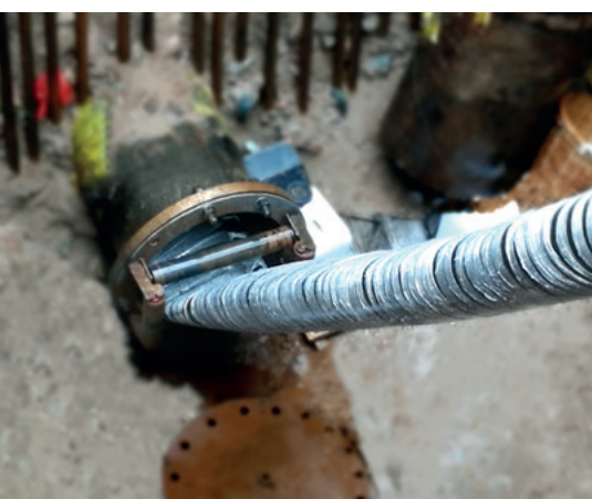
The NORDILONG is the optimal solution for trenchless pipe rehabilitation of pressure pipes